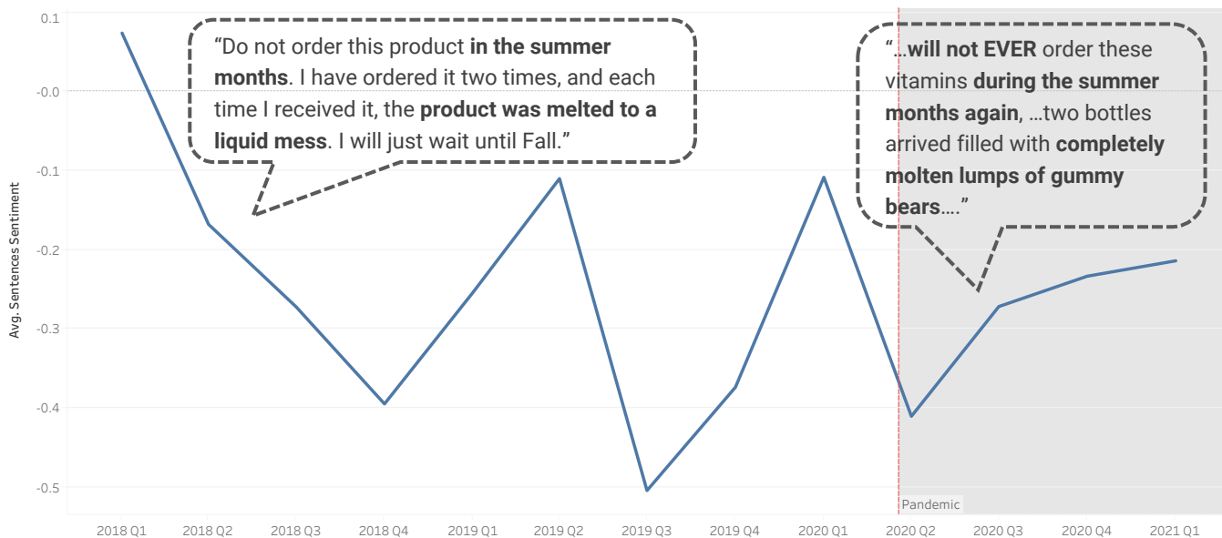
Sentiment over Time For Packaging Related Reviews

The average sentiment of Packaging reviews shows seasonality because gummy multivitamins are heat-sensitive products. Of negative reviews talking about Packaging, 45% are complaints about melted products due to the transit in hot weather. Vitafusion suffers the most, as 57% of reviews talking about 1 melted product are for Vitafusion.